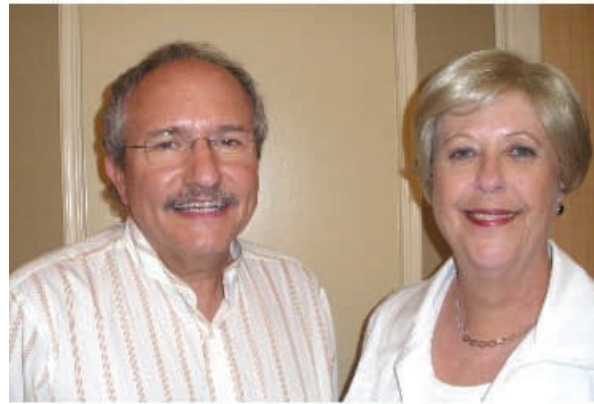
Weds Afternoon Side Flight A,B Boulette - Lightfoot