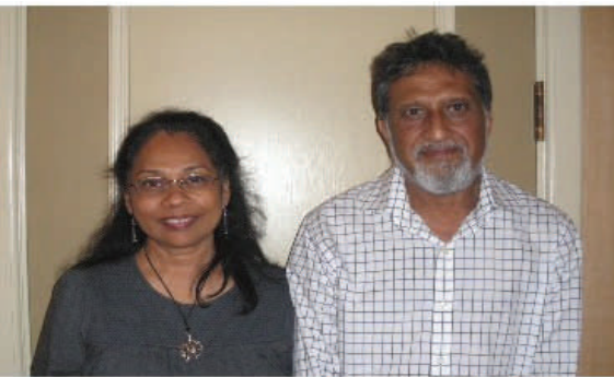
Friday Choice Pairs Flight B Mahajan - Sutavia