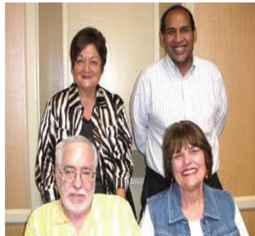
Sat Evening Swiss