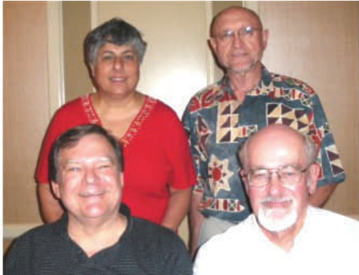
Thurs - Fri KO Bracket 3 Castlebery - Stahlecker- Coon - Ingham