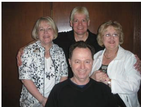
Weds Evening Swiss Flight A Starzek - Morris-Armstrong - Wold