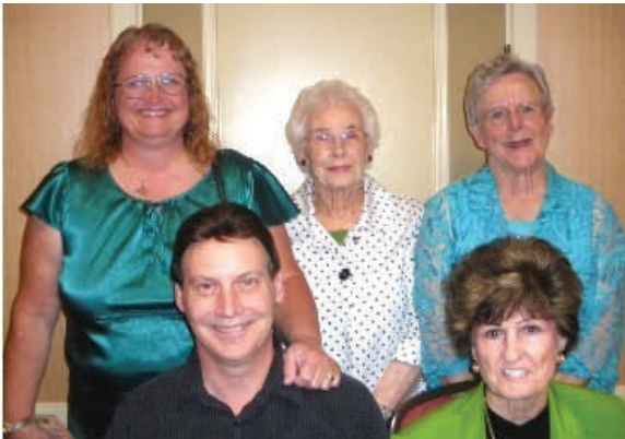
Weds - Thurs KO Bracket 2 Dunn - Stevens - Fursha- Stevens - Warren